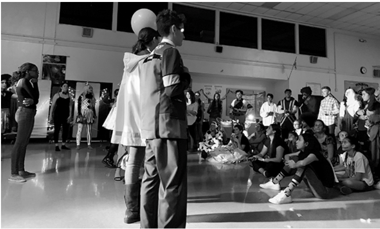
A look at the costume contest from many angles and participants.

well put together and the seniors worked hard”. I completely agree it was amazing! Can’t wait till next year!